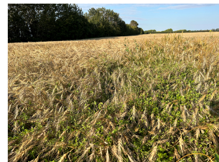
Wheat with chickweed