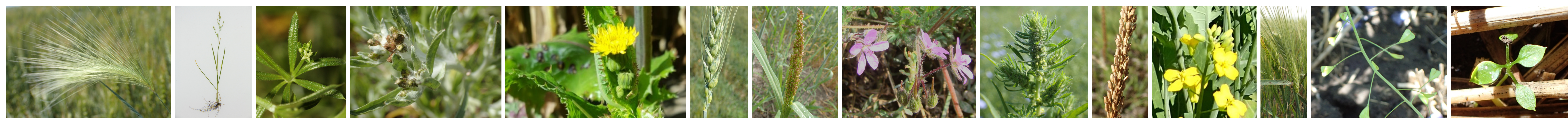
Weeds that have increased the most since the 1970's. Left to right: Foxtail barley, annual blue grass, false cleavers, low cudweed, spiny annual sow-thistle, wheat, barnyard grass species, stork's bill, kochia, broad-leaved plantain, canola, barley, shepherd's-purse, and chickweed